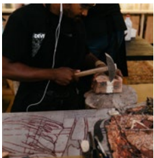
SPIER ARTS ACADEMY

We have developed a device to help tell our social and environmental stories.