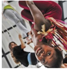
SISONKE SOCIAL CIRCUS