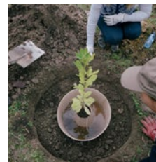
LOVE THE LAND