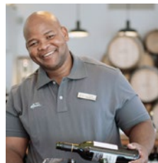
INDIVIDUAL LEARNING SPEND