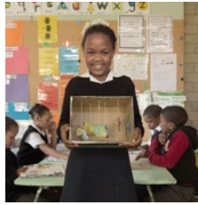
COMMUNITY KEEPERS AT SPARK SCHOOL, LYNEDECH