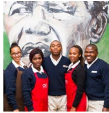
HARAMBEE YOUTH EMPLOYMENT ACCELERATOR

As part of our ongoing business journey, we at Spier are intent on doing things differently and our purpose is to find innovative ways of how business can succeed in balance with our environment and society.